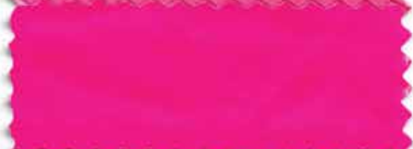
NEON PINK 614