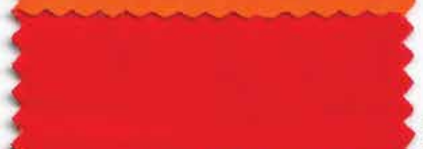
HOT CORAL 701