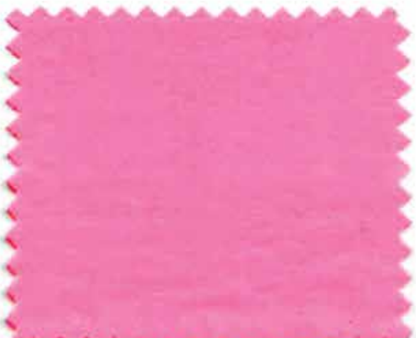
PINK SORBET 2001*