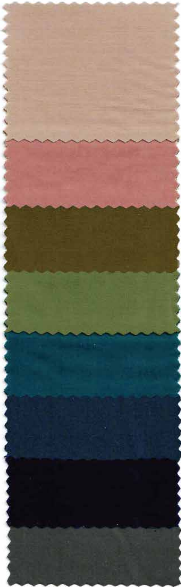
PALE IRIS 551