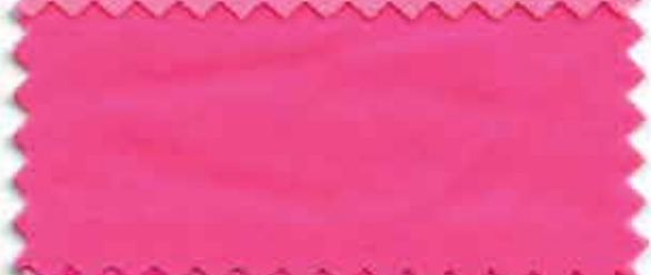
RIG PINK 663*