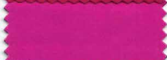
MIXED PINK 641