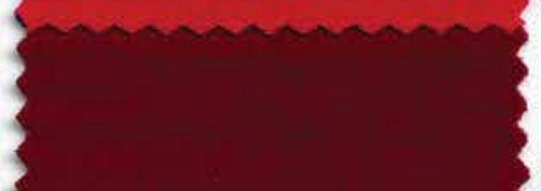
EBI BURGUNDY 766*