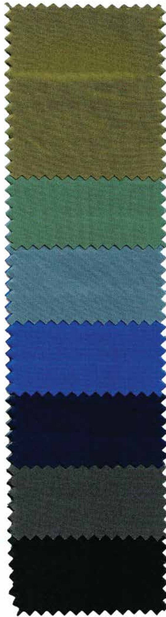
DUSTY OLIVE 479