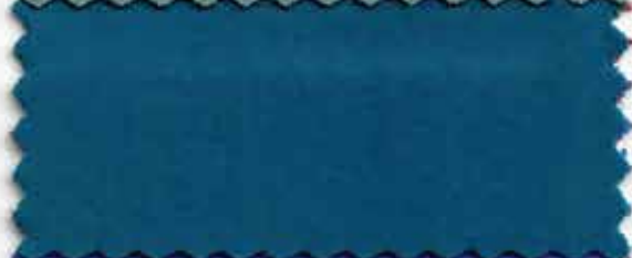
TROPIC TEAL 481