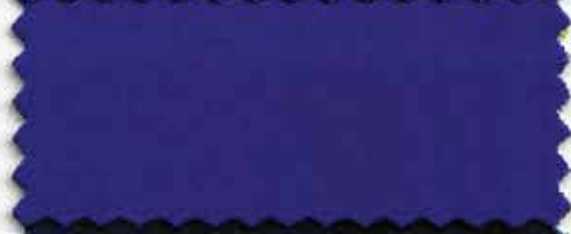
BLUE ME AWAY 486