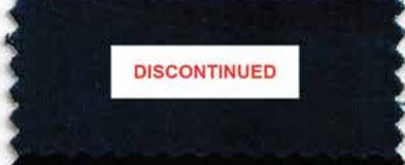
NAVY NIGHTS 483