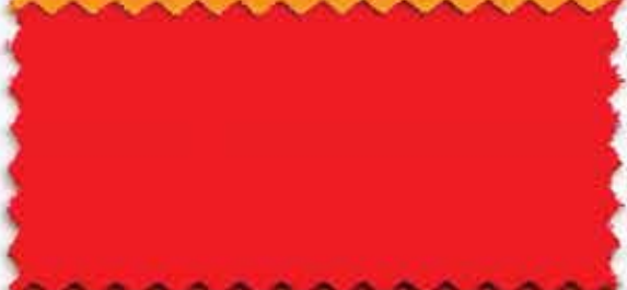
CANDY APPLE 490