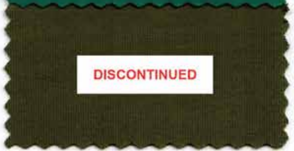
DUSTY OLIVE 479