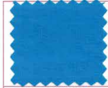
COLOR: TURQUOISE (14)