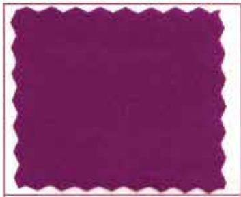
COLOR: ROSEBUD (677)