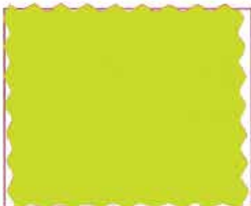
COLOR: LEMON LIME (838)