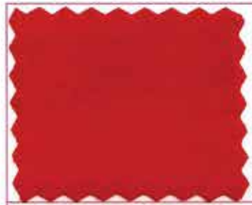
COLOR: POPPY RED (758)