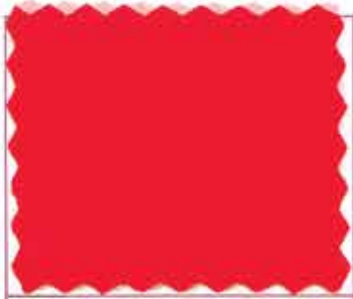
COLOR: WILD WATERMELON (839)