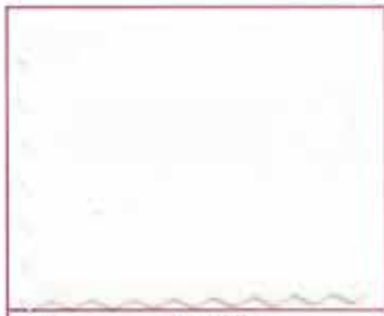
COLOR: WHITE (11)