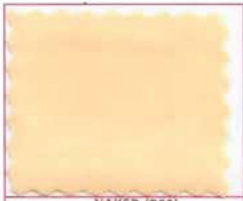
COLOR: NAKED (760)