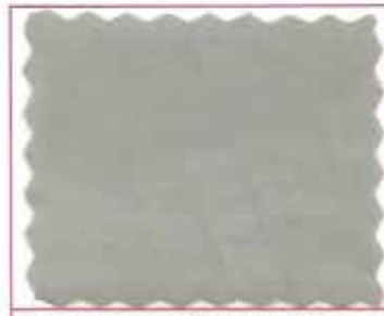
COLOR: STONE (757)