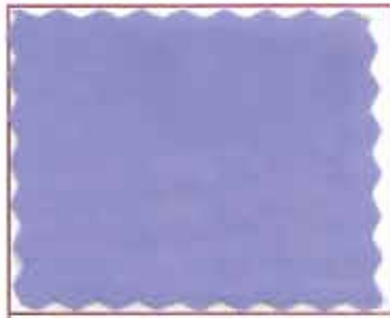
COLOR: LILAC (24)