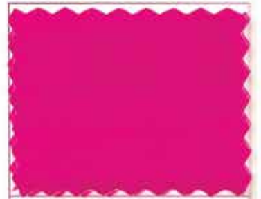
COLOR: FUCHSIA (13)