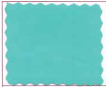
COLOR: CABO BLUE (790)