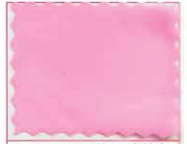
COLOR: PINK SORBET (2001)