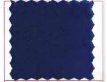
COLOR: DENIM (2068)