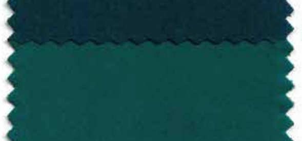
TEAL GREEN 843