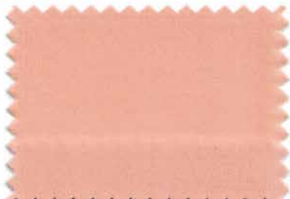
ROSY PEACH 513