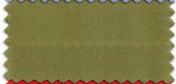
MOSS GREEN 706